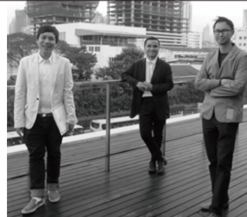
Shma Co, Ltd

In metropolitan, housing is transforming from horizontal community to vertical units as population increases. In Bangkok, the urban environment suffers from pollution, dust and increasing concrete surfaces from highrises. To rebel against such phenomena, we introduced green façade, wrapping around a condominium sales office. The vertical greenery also distinguishes this sales office from the surrounding solid buildings and structures.